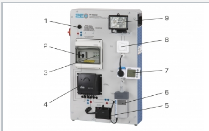
1 connector for photovoltaic modules, 2 DC switch-disconnector, 3 over voltage protection, 4 charge regulator, 5 accumulator, 6 inverter, 7 energy meter, 8 dimmer, 9 halogen lamp